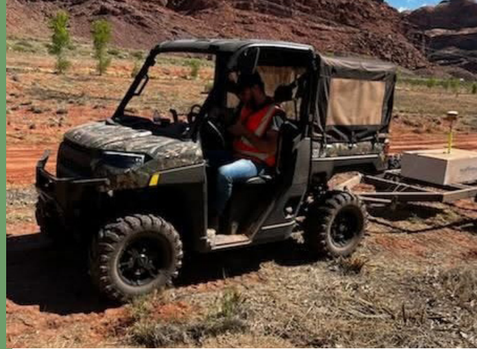
RadVision system in action using the unshielded configuration